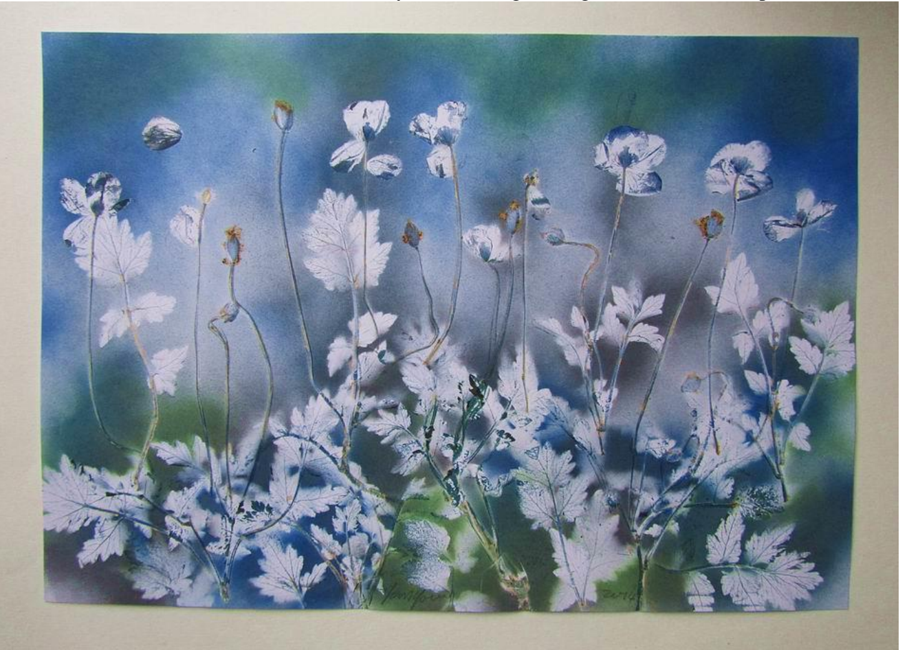
This year also saw the plants becoming the subject for my art for the first time, other than photography - I have completed around 80 A2 sized mixed media drawings of both garden and wild subjects seen in the lanes.

As I round off another year of the Bulb Log I will bring you up to date on the progress of the seeds that I sowed prematurely which then went on to germinate before winter. As you can see they are doing well aided by the milder than normal weather we have had - I feel they are now large enough to survive a cold period.