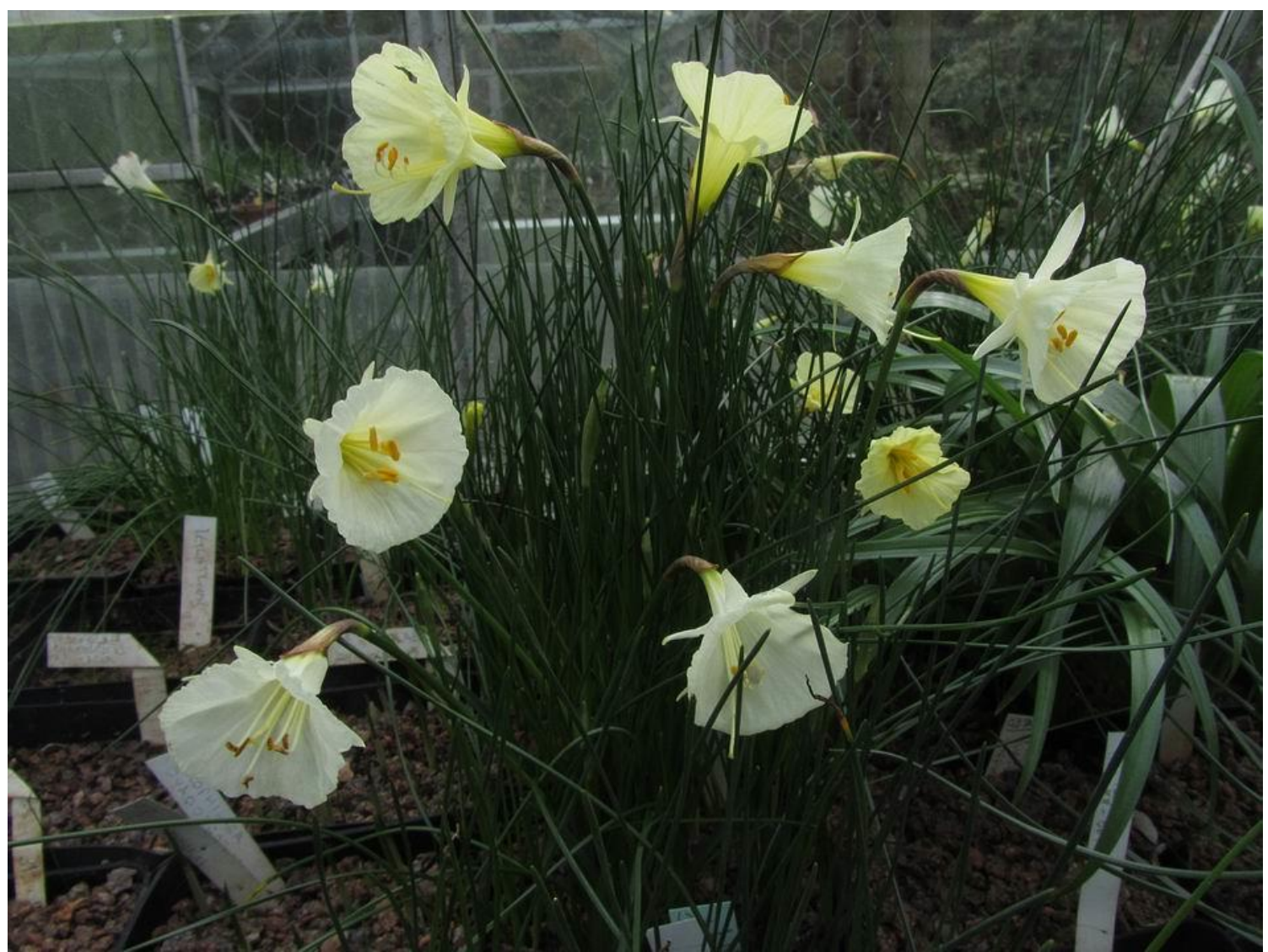
When you grow the Bulbocodioum section Narcissus together you will get all sorts of hybrids occurring. This is a pot of seedlings whose parents include Narcissus romieuxii, N.cantabricus, N.albidus and N. bulbocodium and possibly more!