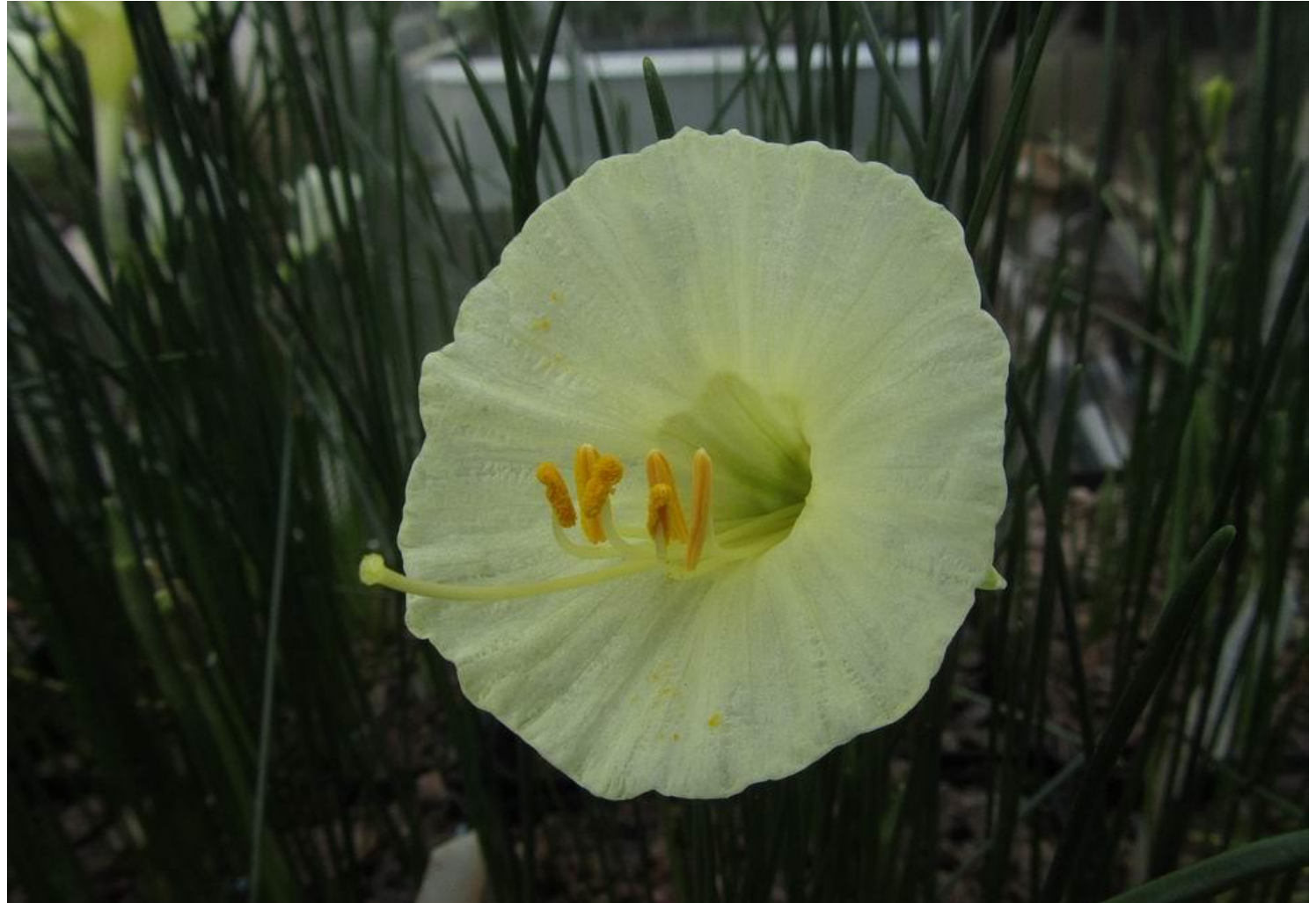
We have derived so many forms from the original Narcissus romieuxii JCA 805 introduction but this one with the very wide flat-faced flower is an original increased vegetatively over the years.