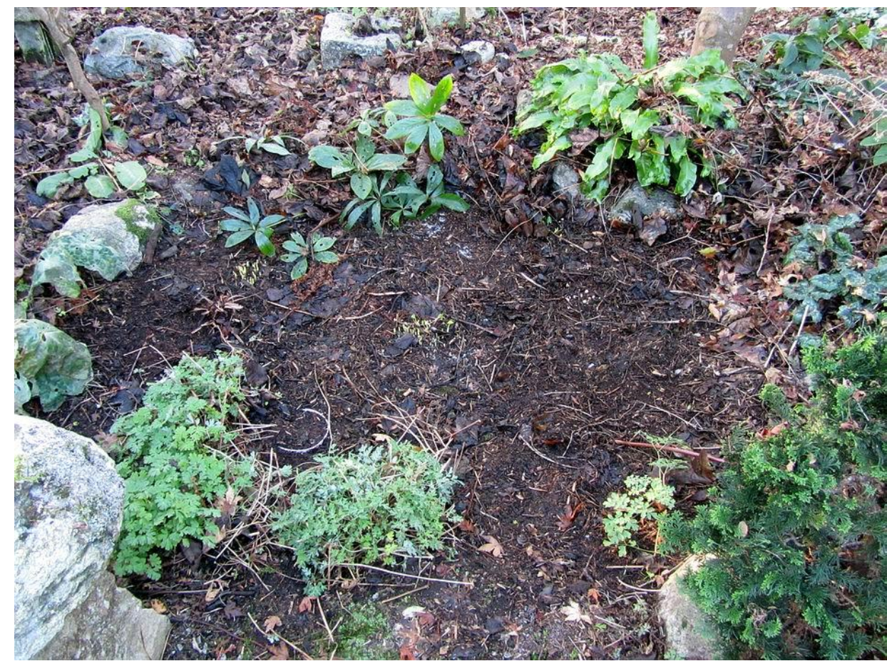
Lifting the leaves reveals many shoots that are now exposed – having removed their protective layer.